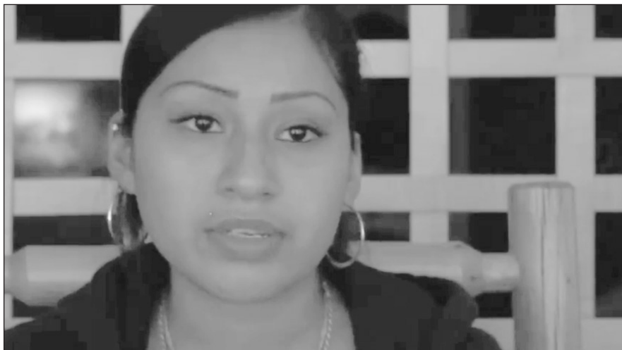
Several Nay Ah Shing students helped create a documentary titled “Non-removable.” A link to the video is available on the education page of the Band’s website ( www.millelacsband.com ).

The young people in Mille Lacs are in a battle for survival, say several Nay Ah Shing students who produced a documentary that explores the problems of violence and drug and alcohol abuse on the reservation. The video was produced in the wake of the deaths of four peers last year.