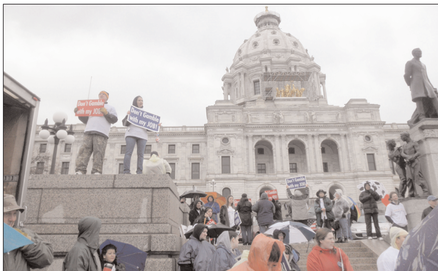
Indian gaming supporters displayed signs at the State Capitol during the "Don't Gamble with Our Jobs" rally. More than 3,000 people attended the rally.

If you would like to express your support for the rally and Indian gaming, please contact your legislators to oppose gaming expansion proposals that threaten jobs in East Central Minnesota. Sample letters are available on the Mille Lacs Band's Action Center on the Band's website ( www.millelacsband.com ).